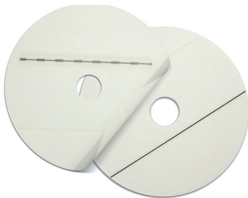
EM CD/DVD labels